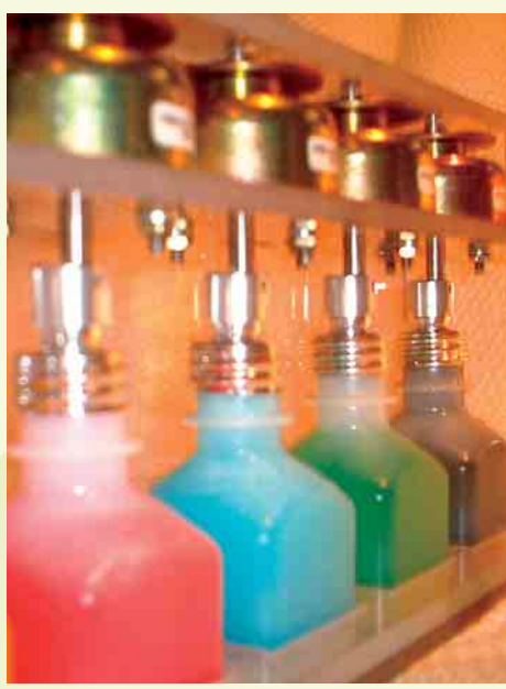
Figure 1a. Solenoid-activated perfume bottles

However, the writers did not include zero as a bit; their figure of 1.5 bits was arrived at by observing that subjects could arrange three bottles containing successive dilutions of 100 percent, 50 percent, and 25 percent odorant in order successfully, and that accuracy decreased after that point; it was assumed that subjects could distinguish between 0 percent and 25 percent solutions of a scent. Counting that zero point, we would describe this result as meaning subjects could distinguish two bits or four categories of smell intensity. This can be thought as