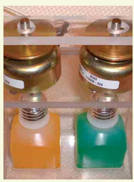
Figure 1b. Solenoid-activated perfume bottles

Fundamentally, there are only a few methods to get scent into the air from a source. The control side is comparatively simple: The computer, be it a full-featured desktop machine or a simple embedded chip, sends a signal out through a serial or parallel port to a relay, which turns on the output device itself for a designated period of time.