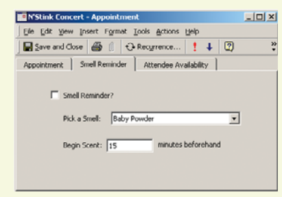
Figure 3. Microsoft Outlook's "Scent Reminder"

from $25,000 or more for a large-scale system suitable for scenting an auditorium or theme-park ride to $50 for a simple, serially controlled, single-scent, desktop device.